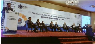
The Sixth South and South-West Asia Forum on the Sustainable Development Goals was held from 5 to 7 December 2022, in Islamabad, Pakistan, in cooperation with the Government of Pakistan and the Sustainable Development Policy Institute. This year's theme, "Accelerating the recovery from COVID-19 and the full implementation of the 2030 agenda for Sustainable Development at all levels" provided ample ground to facilitate discussions on overcoming global challenges within the subregion that were aggravated by the S-CoVid-19 pandemic, and climate change.

COVER ARTICLE: SIXTH SOUTH AND SOUTH-WEST ASIA FORUM ON THE SUSTAINABLE DEVELOPMENT GOALS COMMITS TO STRONGER REGIONAL COOPERATION TO OVERCOME GLOBAL CHALLENGES