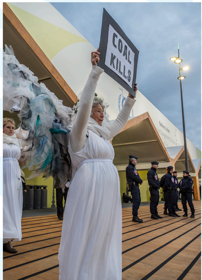
Protesters outside the Le Bourget conference venue at COP21.