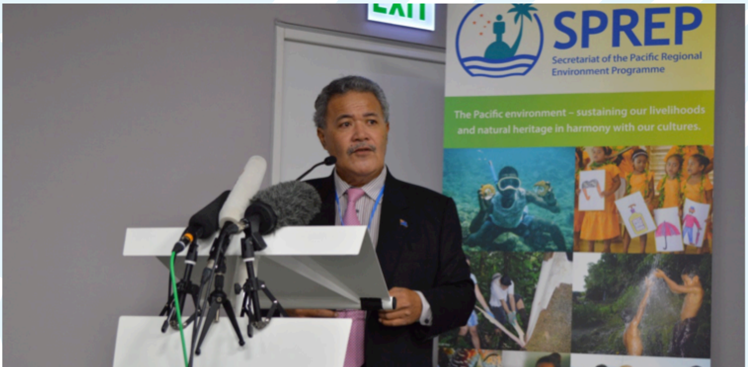
One Voice: Prime Minister of Tuvalu, Hon. Enele Sopoaga joined other Pacific leaders in raising the Pacific's voice at COP21.

The Pacific's overriding reaction to the Paris Agreement has been quite positive with the outcome turning out to be more than expected for Small Islands Developing States (SIDS). Much of this is owed to the outstanding leadership by the Pacific Islands, its consistent messaging and its very strong and compelling voice at the COP21 summit in Paris last December.