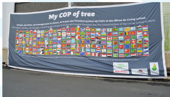
“My COP of Tree” - Messages calling for global action against climate change are posted on country flags on a mural at the entrance to the COP21 “Blue Zone” at the conference venue in Le Bourget.

“I believe that we can and are taking a leadership role in coming up with solutions, however, these solutions will not amount to the total sum of contributing to the good of our world, if the collective will of the world is lacking,” she said.