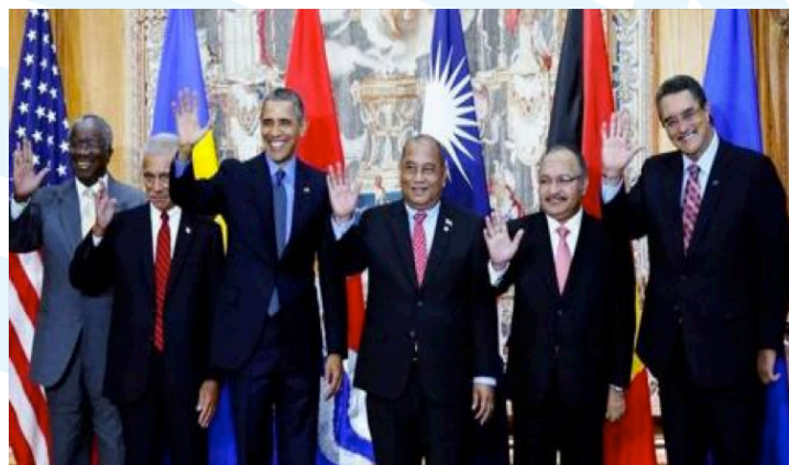
“Island Boy”: President Barack Obama met leaders of Small Island Developing States at the start of the COP21 climate talks in Paris.

Obama also said he had a special connection to the island countries given his time in Hawaii and Indonesia as a child: “I’m an island boy,” he said.