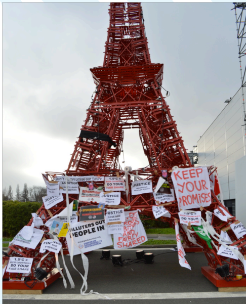
"Keep your promise!" - Messages of hope and calls for action adorn a mini version of the Eiffel Tower at the COP21 conference venue at Le Bourget, Paris.

The agreement will enter into force after 55 countries that account for at least 55% of global emissions have deposited their instruments of ratification.