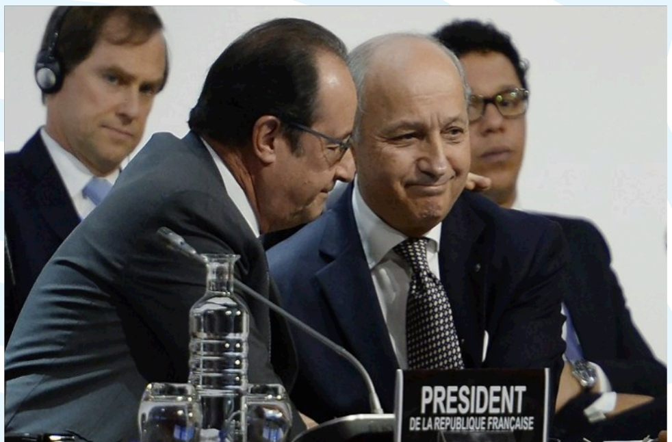
French President François Hollande (left) has a quiet word with COP21 President and French Foreign Minister, Laurent Fabius during the negotiations.