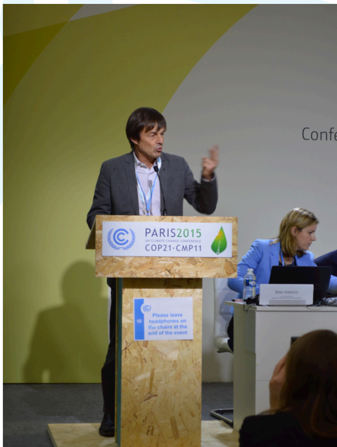
Nicolas Hulot, Special Envoy of the French President for the Protection of the Planet called for immediate solidarity with people suffering from climate change.

Jan Egeland encouraged those in Northern countries to "look in the mirror" saying, "we who caused climate change must do something to change it. We need to look at building defence systems for those who don't want to flee their countries. We have to work together to build hope and a future for those exposed to extreme weather conditions."