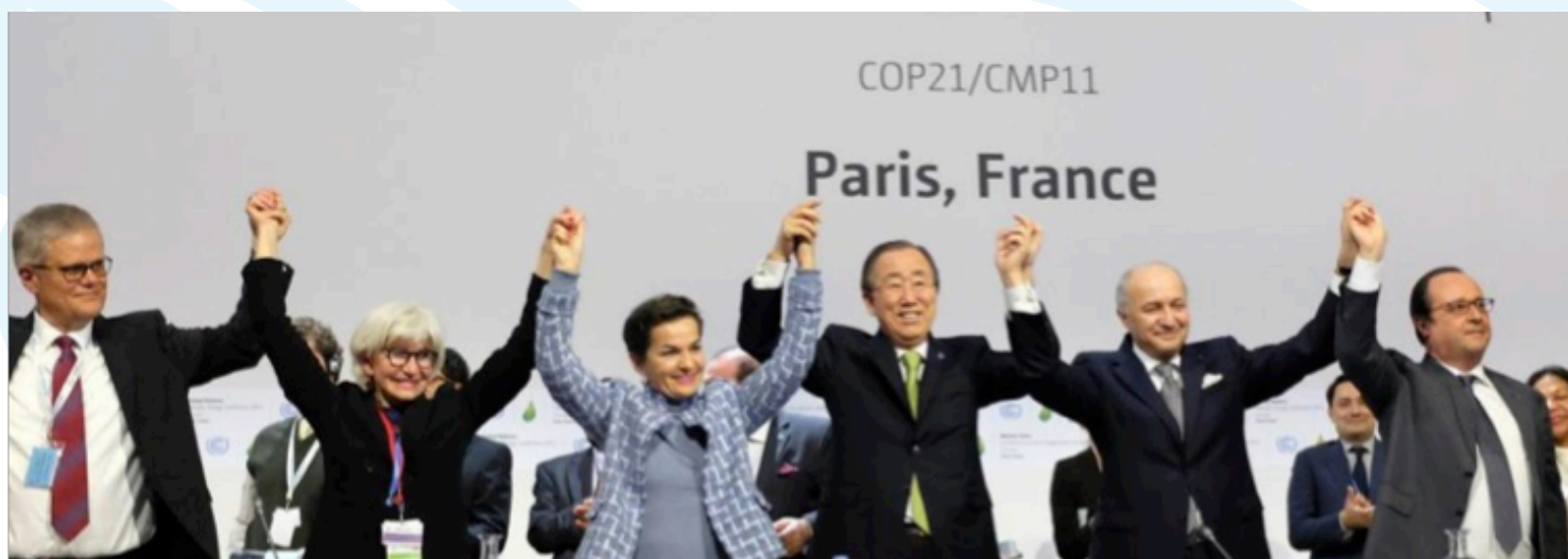
History in the making: UN Secretary General Ban Ki Moon (centre) is flanked by Christiana Figueres, Executive Secretary of the UNFCCC (left), Laurent Fabius, President of COP 21 and French Foreign Minister (right) and French President Francois Hollande following the adoption of the Paris Agreement on 12 December, 2015.

The unprecedented call for climate justice echoed from all corners of the world and was brought inside the walls of negotiating rooms at COP21 in Paris last December. These pleas and demands – the result of long, arduous hours spent inside negotiating rooms at the COP21 Le Bourget conference venue – are now reflected in the pages of the Paris Agreement – even if the means to achieve them are yet to come.