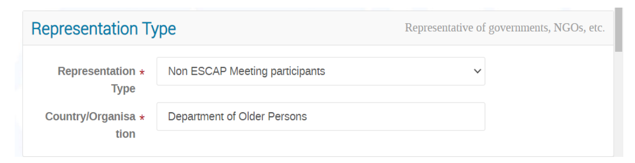
Step 2 Google Form Registration: please register via <a href="https://bit.ly/ESCAP80SideEventReg">https://bit.ly/ESCAP80SideEventReg</a> by 19 April 2024

3) Select "Non-ESCAP Meeting participants" and type to add the organization name (if you can't find it from the drop-down menu), and proceed to complete the rest of the profile.